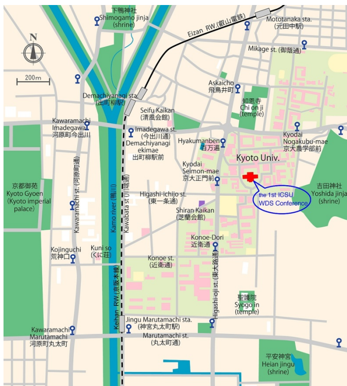
Kyoto Univ. Area Map