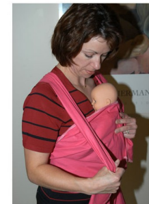
Figure 11. Position infant.