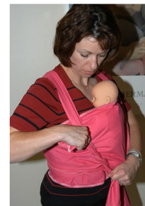
Figure 12. Tie top strap to bottom strap using square knot.