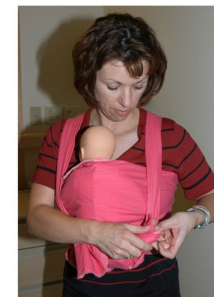
Figure 13. Tie other top strap to bottom strap.