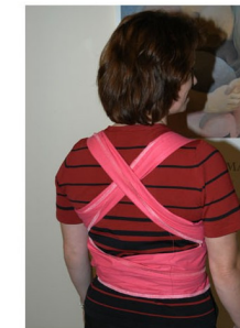
Figure 10. Straps crossed in back.