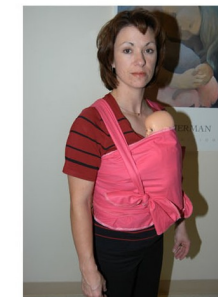
Figure 14. Infant secure in KMC wrap.