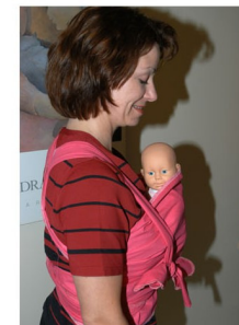
Figure 15. Center piece properly positioned beneath infant's ear.

These pictures just demonstrate how the thari should be tied and how the infant should be position. A doll was used for this demonstration!