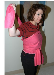
Figure 9. Cross straps and bring over shoulders.