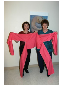
Figure 4. The KMC wrap.

The thari is made out of Polyester-cotton material. It can be machine-washed and tumble dried. Ironing – medium steam setting.