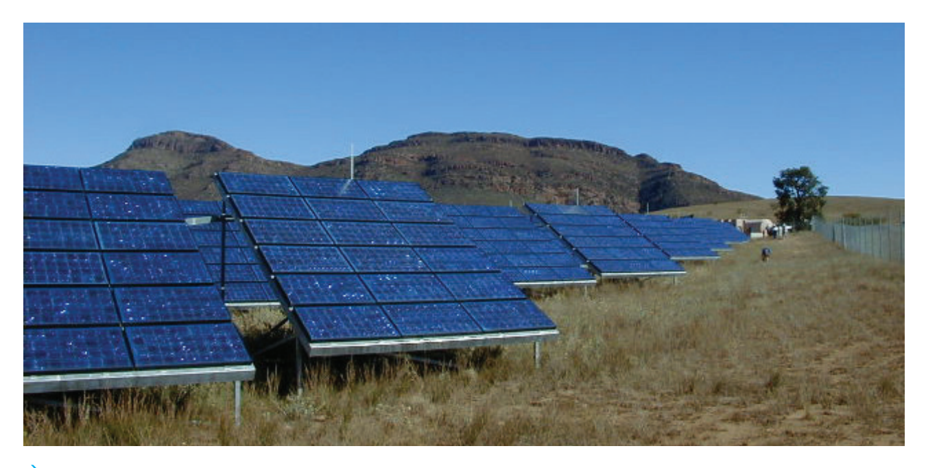
ightarrow Solar energy is a renewable resource.

(a joint effort between the Department of Chemistry in the Faculty of Natural and Agricultural Sciences and the departments of Chemical Engineering, and Materials Science and Metallurgical Engineering in the Faculty of Engineering, Built Environment and Information Technology) and the SARChI Chair in Fluoro-materials Science and Process Integration in the Department of Chemical Engineering are at the leading edge of specialist materials research in South Africa. Further research is also being done by the departments of Chemistry and Physics, including cutting-edge materials and computational modelling using the University's state-of-the-art cluster computing facility.