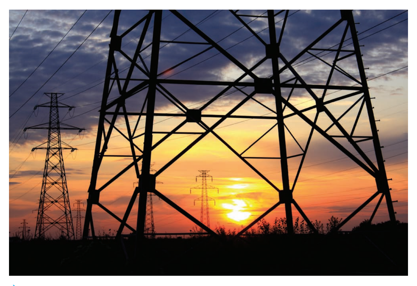
\rightarrow Energy distribution forms part of the University's institutional research theme.

(NERDIS), which is being reviewed by the Department of Science and Technology. These policy documents all have in common the issue of energy security and its contribution to job creation, economic growth, research and human capacity/skills growth. These are underpinned by the Department of Economic Development's draft New Growth Plan, released in November 2010.