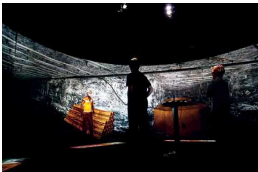
→ The Kumba Virtual Reality Mine Design Centre will be able to realistically simulate a range of mining functions.

undergone major improvements in quality and speed. By investing in the VR Mine Design Centre, Kumba is living out its belief that all injuries are preventable, and its commitment to making safety a way of life – both inside and outside the workplace.