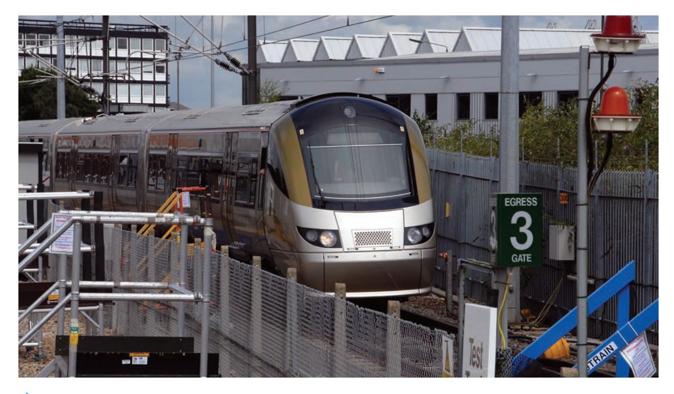
→ The Gautrain set on the test track at Bombardier's Testing Facility, Derby, in the United Kingdom.

other facilities, such as station precincts and vehicle parking areas.