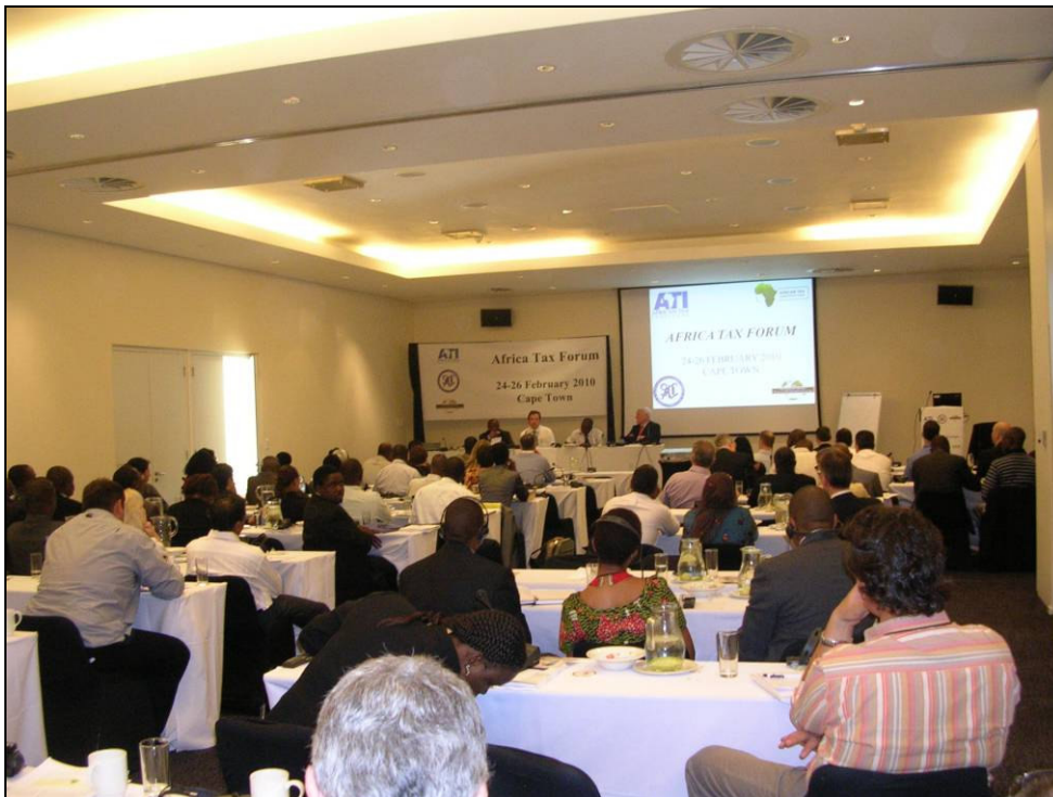
Delegates attending the opening session of the African Tax Forum – 25 February 2010.

This conference was attended by more than 100 delegates from predominantly SADC countries, although there were delegates and speakers from other countries in Africa, including Ghana, Libya and Uganda.