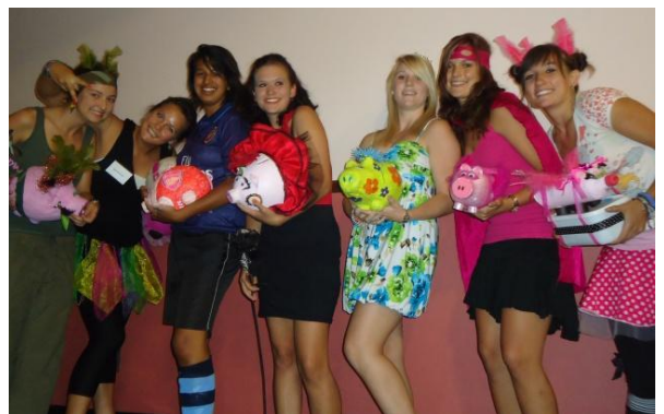
Spikkels and their Grietjie Piggys

One of Magrietjie’s famous traditions, Miss Grietjie Piggy, was once again a huge success this year. All the first years had to make their own piggy filled with coins in order to raise funds for RAG. The Spikkels and their piggy’s were dressed to impress and everyone enjoyed the funfilled evening.