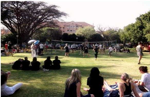
Volley-ball on the lawn with other girls residences

It was something special to experience a "girls only" residence social and we are proud to have been the hosts of this bonding session. However, you can't possibly get away with an event like this without having some men supporting the games. Our hot dog stand did not complain for the extra bussiness though ☺.