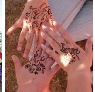
Glimpses of Pot and Pons