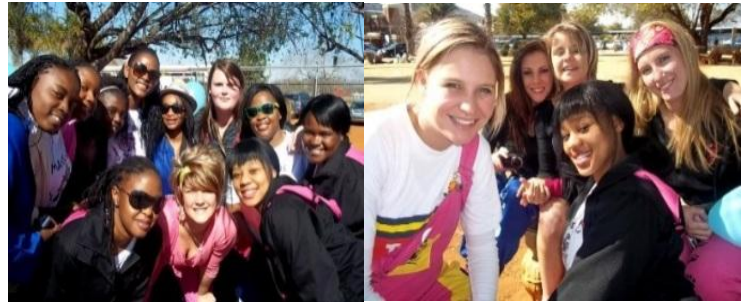
Rag project and blikskud

The Mags ladies were once again up for a day of blikskud at Hartbeespoortdam. As the pictures will tell you, this was a CRAZY day!!! Afterwards we went to Dr. George Mukhari hospital in Garankuwa where we spent some time in the paediatric ward and gave the kids cupcakes and funpacks. It truly was a blessed experience and a lot of worthwhile fun on top of it!