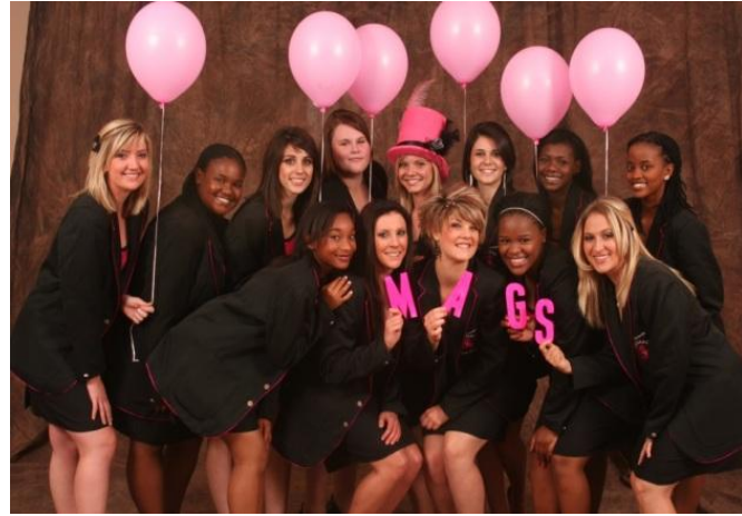
Festival year EC

It's THAT time of the year again... where we count down the months until Maer Grietjie celebrates her 30 th birthday. Looking through the archive, one realises that it was only 9 years ago that we celebrated our 21 st birthday - and now we are fortunate yet again that this beautiful pink palace is celebrating its festival year. And it promises to be a great year. For this special year 13 ladies (an extra lady for festival year) are elected to serve on the House Committee. The EC for 2011/2012 was announced on 16 August and are a group of determined ladies, excited to take Magrietjie to new heights.