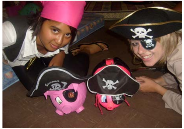
(top) Two enthusiastic Spikkels with their Piggies

Every year, as part of the fundraising initiative of the Rag HK, we have a Grietjie Piggy competition. This entails that each Spikkel has to make her own piggy bank and fill it with change. Each Spikkel and her piggy are then invited to the Grietjie Piggy fashion parade where both owner and piggy have to exhibit their theme on the catwalk. There were various category winners such as the heaviest piggy, best dressed piggy and the most original piggy. A total of R9000 was raised for RAG through this fun event.