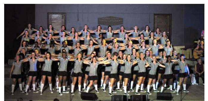
1<sup>st</sup> in Serrie 2010

Oops, Magrietjie did it again!! Serrie 2010 once again belongs to the pink ladies. The black-and-white "referees" of Mags stole the show, not only winning the finals, but also first place in the pre-lims as well as winners of the "best reception at res". Serrie was a truely pink affair this year! Second place went to Klaradyn with Asterhof in third place. The winners of the men's division were the "Toysoldiers" of Vividus (day house). Second place was awarded to Boekenhout and the third spot to Maroela.