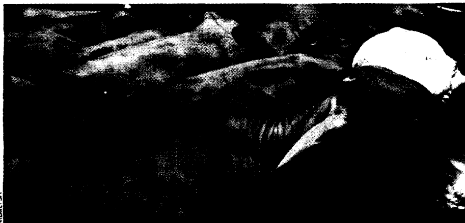
The quality Intervet Allflex ID tags and the unique numbering system are an SA design. They provide a unique identity or "fingerprint" for each animal, enabling ongoing individual monitoring with authentication in a central database.