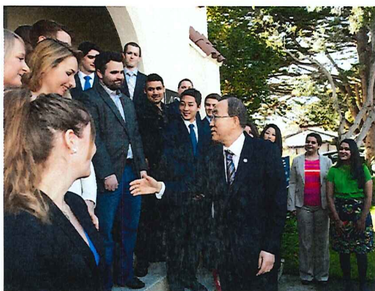
United Nations Secretary-General Ban Ki-moon gave a major policy address about nonproliferation and disarmament at the Middlebury Institute on January 18, 2013.