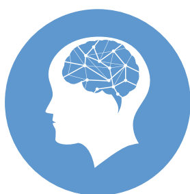
Mental Health - Coping with stress and anxiety during the COVID-19 outbreak