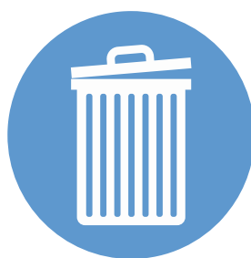
Doffing Your PPE