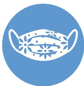
How To Wear a Cloth Mask