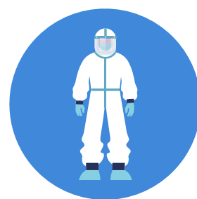
Donning Your PPE