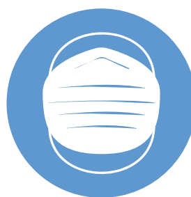
How to Don Your N95 Respirator