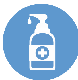
Hand Hygiene: Alcohol-based Rub