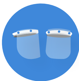
How To Wear a face shield