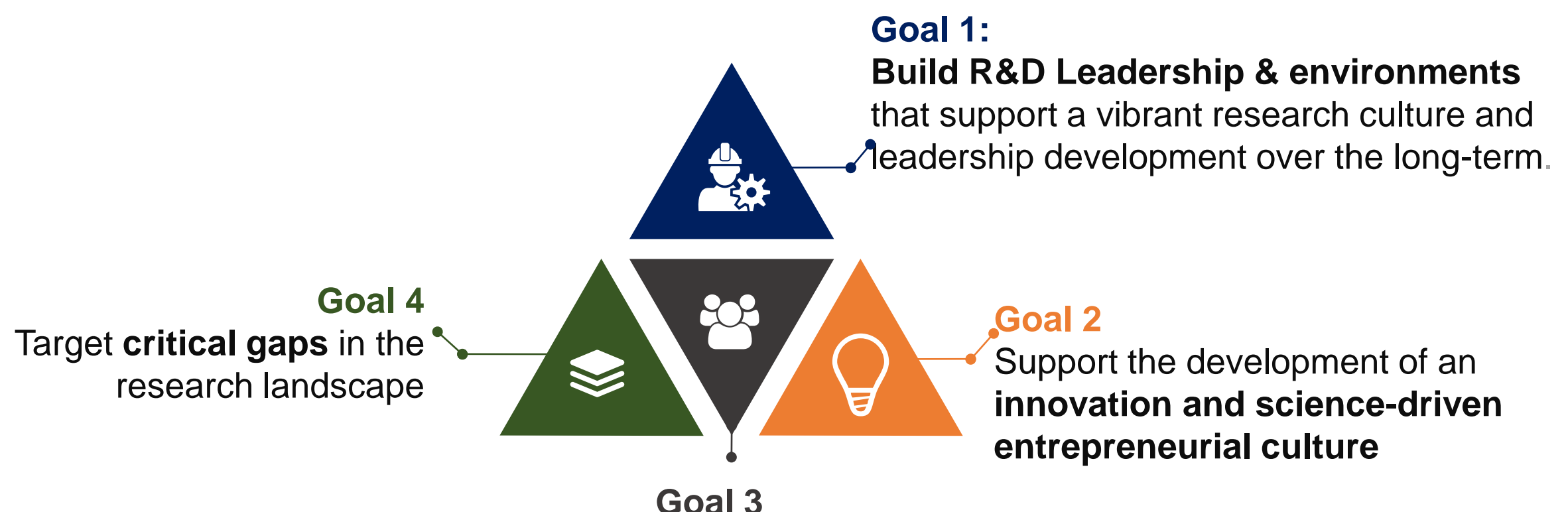
Identify and support rising research leaders to stay and build their careers in Africa

Shifting the centre of gravity of African science to Africa