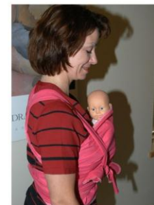
Figure 15. Center piece properly positioned beneath infant's ear.

These pictures just demonstrate how the thari should be tied and how the infant should be position. A doll was used for this demonstration!