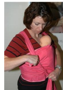
Figure 12. Tie top strap to bottom strap using square knot.