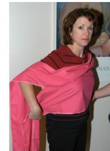
Figure 5. Wrap bottom straps around back.