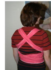
Figure 10. Straps crossed in back.