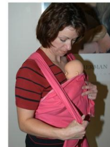
Figure 11. Position infant.