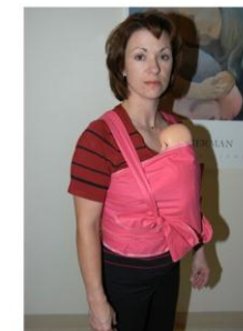
Figure 14. Infant secure in KMC wrap.