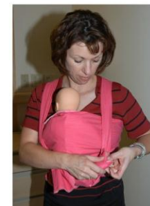
Figure 13. Tie other top strap to bottom strap.