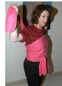
Figure 9. Cross straps and bring over shoulders.