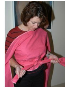
Figure 7. Secure with square knot just below the breasts.