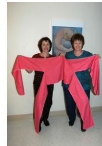
Figure 4. The KMC wrap.

The thari is made out of Polyester-cotton material. It can be machine-washed and tumble dried. Ironing – medium steam setting.