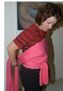
Figure 8. Wrap top straps around back.