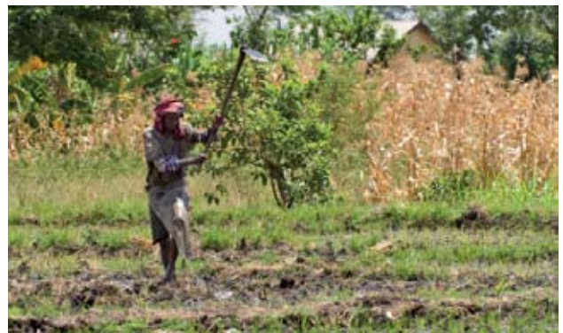
Farmers benefit from swift land dispute resolutions.