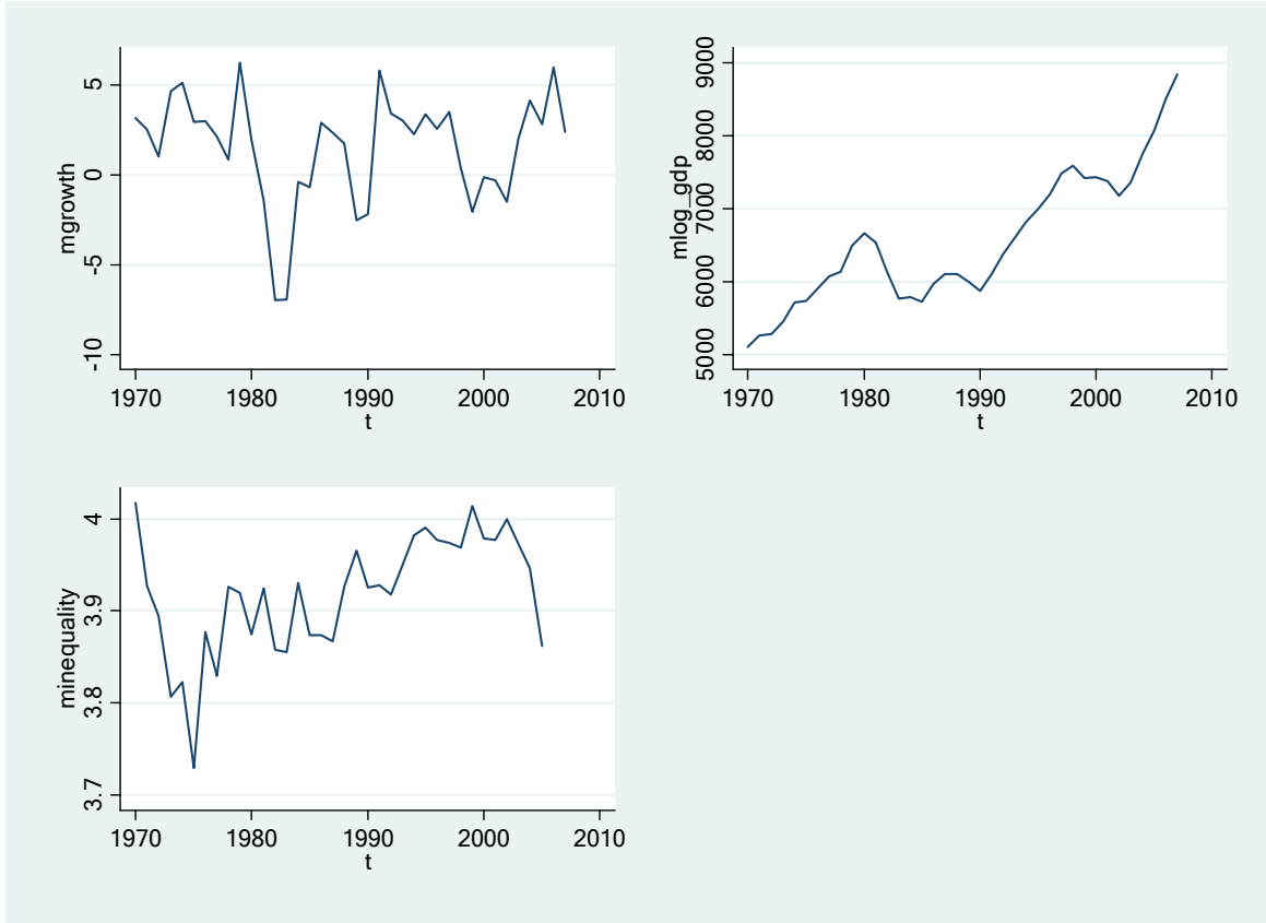
Figure 1: Economic growth ( GROW ), GDP per capita ( GDP ), and Inequality ( GINI ), South America, 1970-2007. Source: PWT and UNU-WIDER files.

Moreover, in Table One we provide the correlation matrix amongst all variables used in the analysis. The statistical correlation that interests us mostly here is the one between the Gini coefficient of income inequality ( GINI ) and income per capita in logs ( GDP ). This particular correlation is negative and statistically significant at the 5% level, and it indicates (without implying any causation at this early stage) that income growth is associated with lower inequality in this sample.