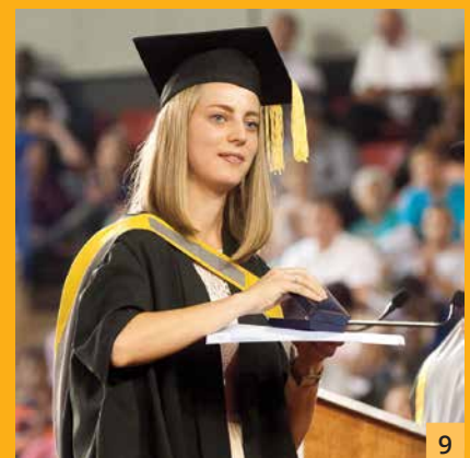
1. Group work. 2. Practical work. 3. Letloto building offers at excellent opportunity for study in a study area. 4. Students share information with one another. 5. Graduation ceremony – the big moment. 6. Workshop. 7. Students use their time to work in groups. 8. Attendance of seminar. 9. Top Achiever.