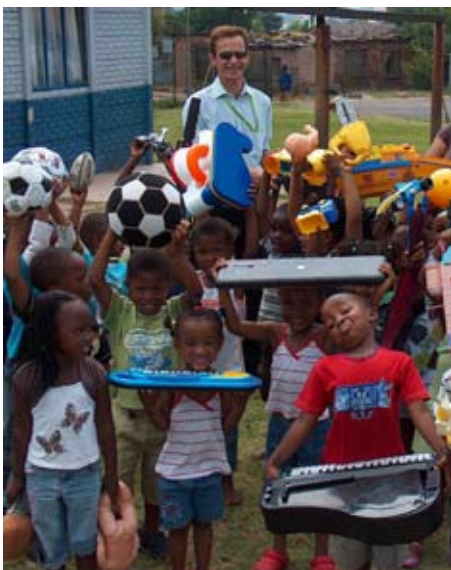
Toys are an essential part of the learning process... as the smiles confirm.