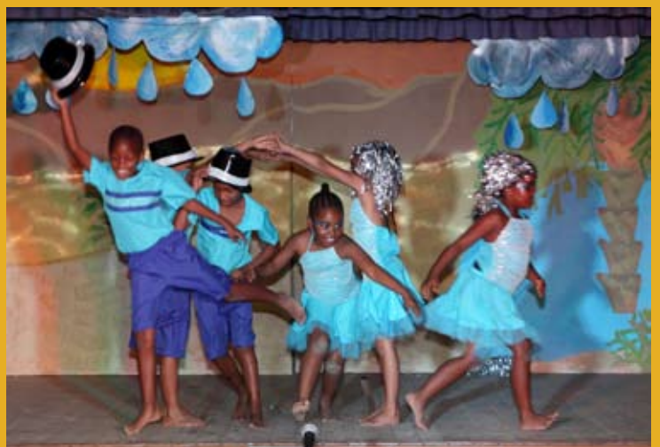
Die leerders het danspassies op bekende liedjies gedoen.