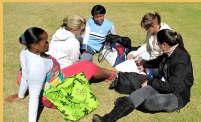
Recipients were selected based on their academic ability.

More information on the Funza Lushaka Bursaries Programme can be viewed at www.funzalushaka.doe.gov.za