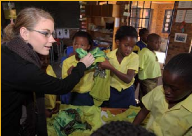
Die kostuums is deur lede van die Mamelodi gemeenskap gemaak.