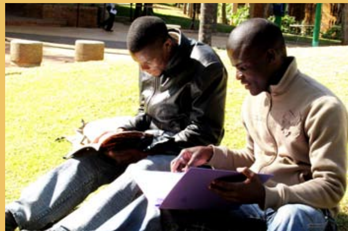
Many of our students benefit from the Funza Lushaka Bursary Programme.

The Funza Lushaka Bursary Programme recently awarded bursaries to the value of R25 million to students in the Faculty of Education. More than 500 students benefitted.