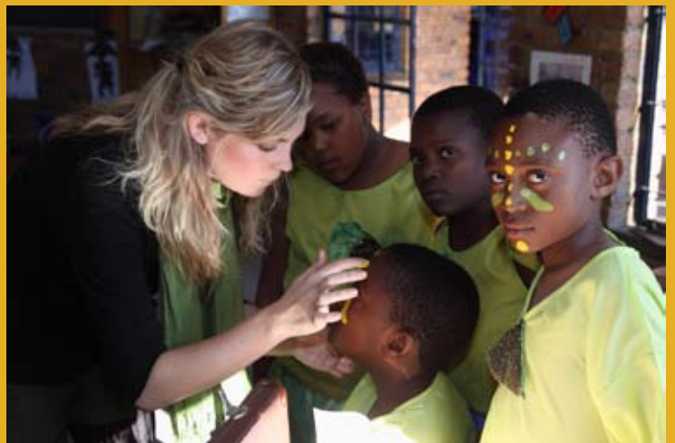
Studente het self gesorg vir die grimering van die leerders.