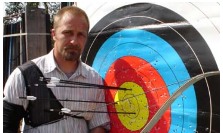
Boogskiet is een van sy grootste belangstellings.