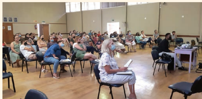
▲ Educators at Prinshof School raise their hands to show their interest in enrolling for the Advanced Diploma in Visual Impairment Studies

The Advanced Diploma in Visual Impairment Studies (VIS) is an undergraduate qualification. After obtaining this qualification, students may apply for enrolment for a postgraduate diploma, or a BEd(Hons) if they have already completed an undergraduate degree in education. Visual impairment is one of the priority areas identified by the Department of Higher Education and Training for the development of qualifications in support of educators teaching children with disabilities. The programme is an NQF Level 7 course with a maximum of 120 credits and is offered only by the University of Pretoria through distance learning.