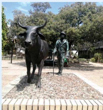
▲ The statue One man, one beast by Mel Oakes erected outside the University of Botswana's library

Visual arts and design not only promote creative skills, but also include critical thinking approaches, problem-solving (design) skills and creative entrepreneurial capabilities through proper training, which is vital for candidates to enter the job market and become financially self-sufficient as practicing artists, art dealers or curators.