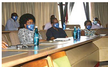
▲ Academic staff at the meet-and-greet session with the Dean of the Faculty of Education