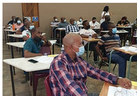
▲ Northern Cape Department of Education students at the Adv Dip SLM induction held in Kimberley

Further specialisation in a teaching subject offered through an Advanced Diploma at