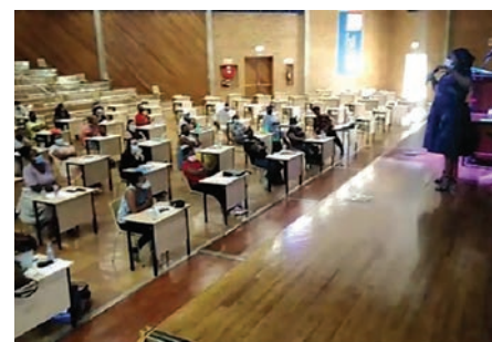
▲ Gauteng Department of Education students at the Adv Dip SLM induction

Level 7 requires cognate studies in that subject at Level 6 in the entry qualification. Students who have successfully completed the previous national Advanced Certificate in Education (ACE) in School Management or Leadership (or an equivalent qualification) may apply for advanced standing in the programme by applying for and completing a Recognition of Prior Learning (RPL) portfolio.