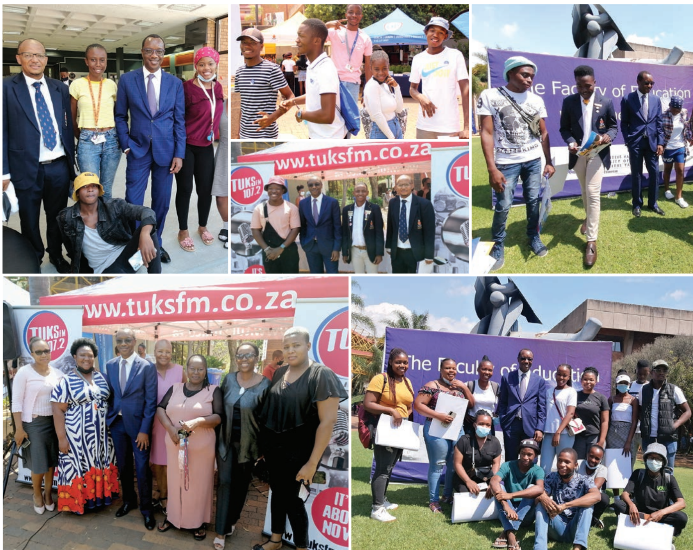
▲ Students and staff at the Groenkloof Campus enjoyed a photo session with the Vice-Chancellor and the Faculty Dean.