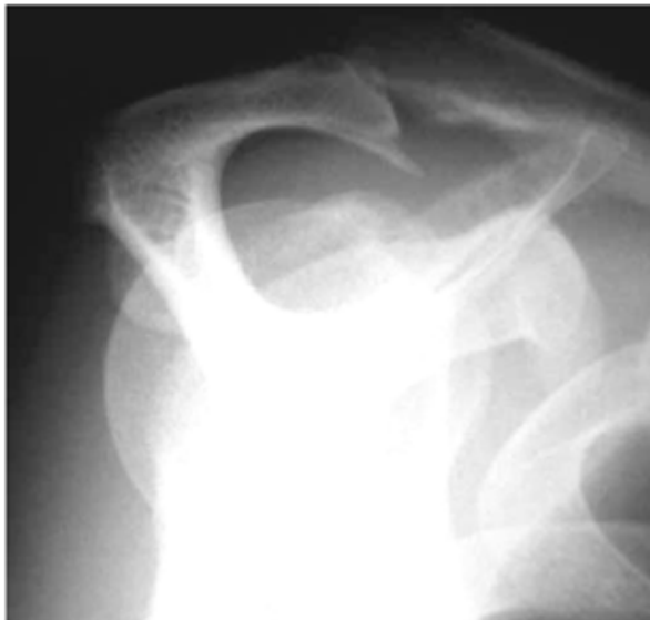
Figure 1: Plain radiograph of a type III acromion with a prominent acromial enthesophyte 8

It is important to recognise that primary and secondary external impingement may not occur in isolation. Underlying scapular dyskinesis may worsen the impingement which is already taking place due to a hooked acromion.