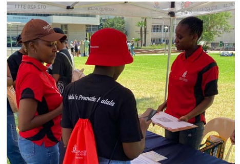
New members registering