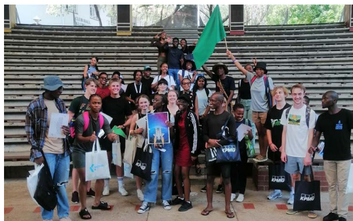
First-year Accounting Sciences students during the treasure hunt

First-year Bachelor of Commerce in Accounting Sciences students kicked off the 2024 academic year with an exciting treasure hunt at the University of Pretoria's Hatfield Campus. The primary objective of this adventure was to acquaint the students with various campus venues, making it easier for them to locate their lecture halls. Click here for more.