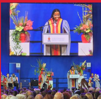
UP Welcome day

By Ath'enkosi Mtshali and Mpiloenhle Radebe