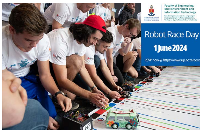
Robot Race Day

This annual race is hosted by the University of Pretoria's Department of Electrical, Electronic and Computer Engineering under the auspices of the Faculty of Engineering, Built Environment and IT. The race involves Microcontroller-based Autonomous Robotic Vehicles (MARVs) built by teams of third-year students who compete against one another to complete our track in the shortest possible time. This unique, annual engineering-education-in-action event is not to be missed by anyone with a keen interest in the future of our South African engineering industry and the bright young talent that is graduating from our engineering programmes at Tuks. Click here for more.