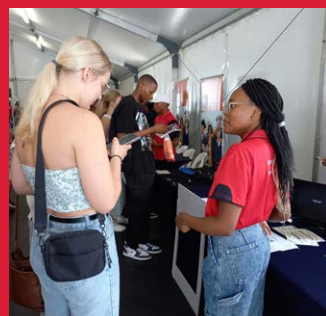
Orientation week 2024

“Hi, guys, do you know where I can find the ClickUp building?” We’ve all been there, right? Maybe you weren’t looking for the ClickUp building; instead, you were looking for the AIM Labs, Centenary, Thuto or the Student Services Centre. Navigating one of the biggest campuses in South Africa can be a bit of a challenge, which is why JuniorTukkie Student Ambassadors set aside some of their time to assist first-year students with campus navigation. The principles we share as a Society are uplifting others, harnessing academic potential, and inspiring future leaders through giving back, while keeping our inner child smiling from ear to ear through fun, games, and selfies! Because that’s what young leaders do!