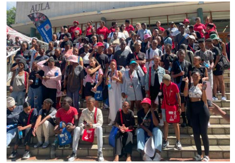
JuniorTukkie first-year welcoming