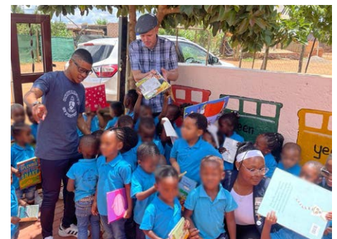
Mamelodi read aloud day with UP postgraduates and pre-schoolers.

The students spent time with the learners reading and playing with them. Reading aloud to children has a huge impact on how they receive and engage with books. It enables them to develop literacy skills as well as spark a love for reading.