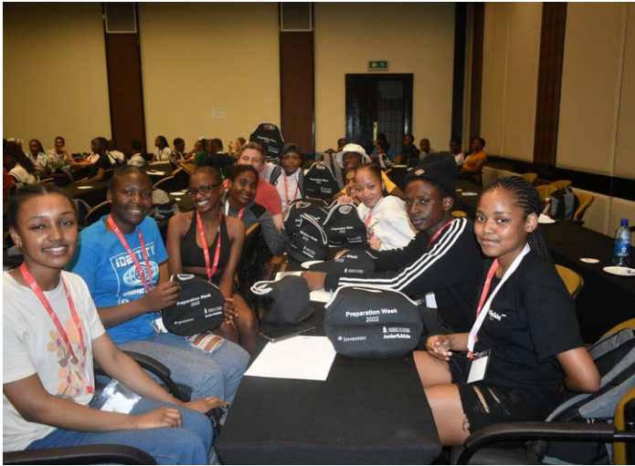
Grade 12 learners during the Preparation Conference

JuniorTukkie hosted 150 learners from different schools and provinces at the Grade 12 Preparation Conference held at Southern Sun Pretoria from 30 September to 2 October 2023. This inclusivity allowed participants to familiarise themselves with new faces they might encounter in their university journey, preventing feelings of isolation and boredom.