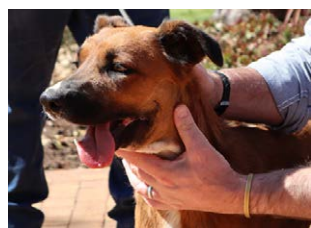
Phoenix at the OVAH during her follow-up visit