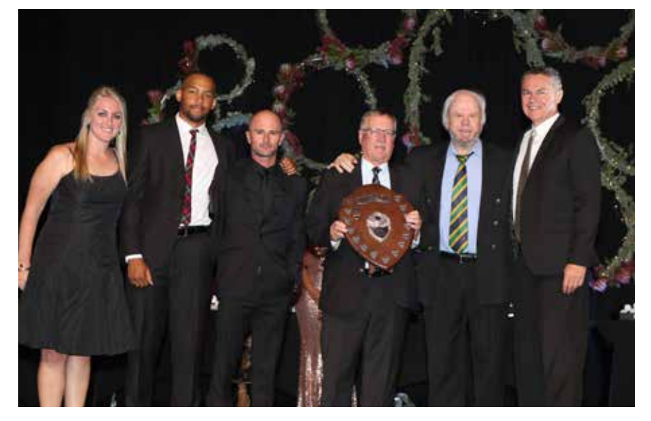
Sport Club of the Year: TuksCricket