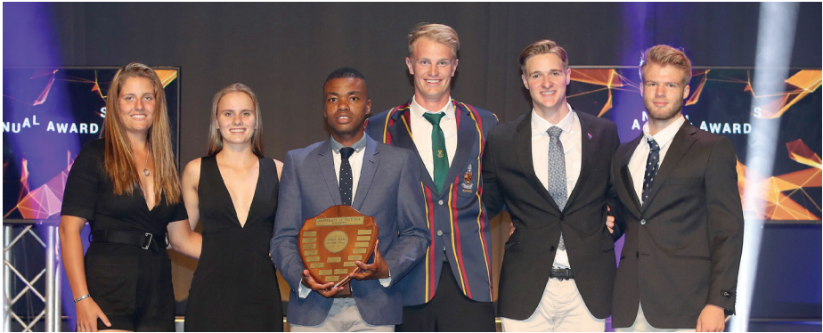
Student Sports Club of the Year: TuksRowing