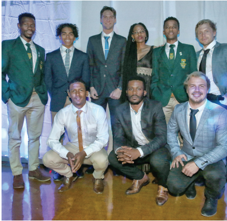
Team of the Year Awards: Tuks Rowing