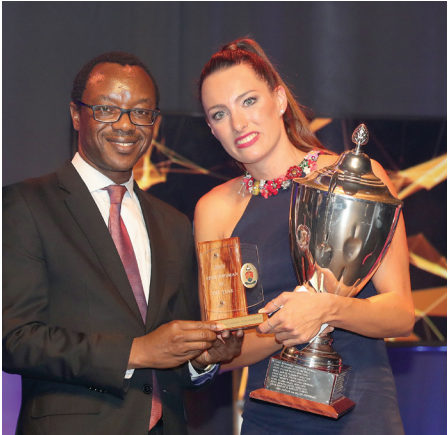
Sportswoman of the Year: Tatjana Schoenmaker