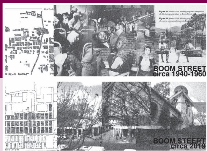
↑ Boom Street (then and now)

Address Theology Building, Room 1-15, Hatfield Campus