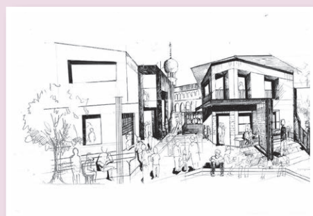
↑ Integrating boundaries