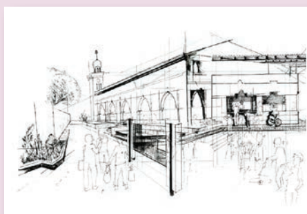
↑ Internal courtyard