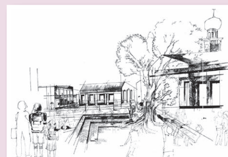
↑ Recreational courtyard