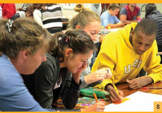
1. Students appreciate the beautiful Groenkloof Campus 2. Students receive assistance in the Education Library 3. Staff, students and learners at the #ChooseUP event 4. Discussion session 5. Computer laboratory 6. Lilium residence at the #ChooseUP event 7. Students relax between lectures on our beautiful campus 8. Group work