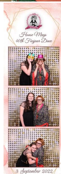
3 September 2022