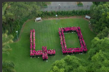
House photo on the front lawn, celebrating 40 years of blessings. Taken on Thursday, 24 March 2022 at 06:00 in the morning to commemorate this milestone.