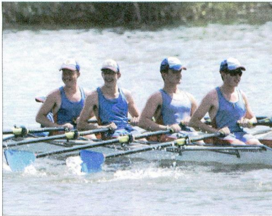
The St Benedict's under-15A quad won their race.