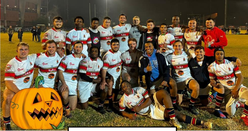
TuksJongSpan at Loftus Versfeld.