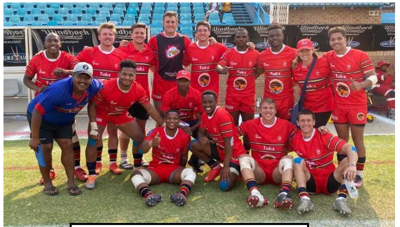
2022 USSA 7s Tuks Mens team

On the final day our men came short in the quarter final. It was a hard-fought battle against CPU who beat our men 14-12. Fortunately, our men won the plate final against NMU to secure a 5 th place finish. Our ladies team managed to secure a spot in the finals for the old Tuks-Maties rivalry, which is commonly seen amongst the men. Maties women's team had the final say, claiming the 2022 USSA 7s