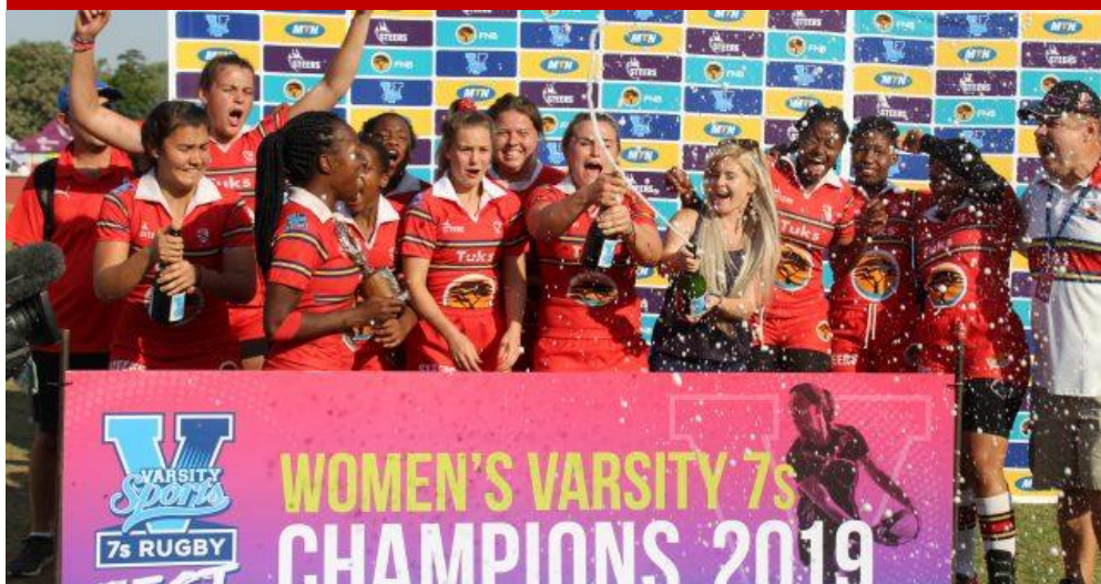
DeltaDrone TuksWomensRugby, 2019 Varsity 7s Champions

The Varsity 7s is back and it's bigger and better than ever! The last Varsity 7s tournament took place in 2019 where our men won the plate final. 2019 was the first time that the tournament included women's teams and our Tuks ladies did what they normally do, and dominated the tournament.