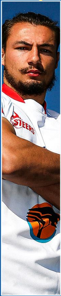
VARSITY CUP PLAYER OF THE PLAYER