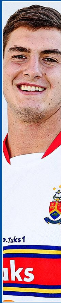
MEN'S PLAYERS' PLAYER OF THE YEAR