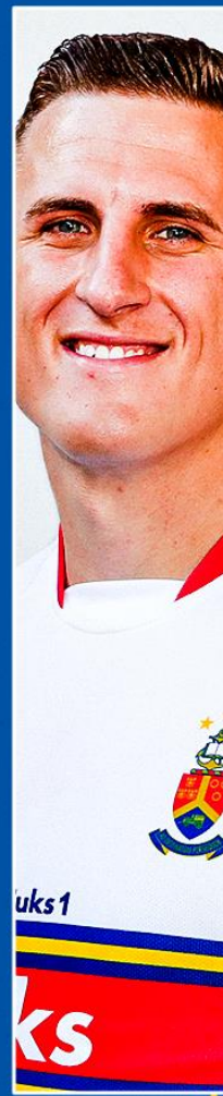
MEN'S PLAYER OF THE YEAR