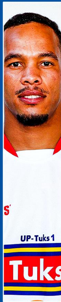
SENIOR PLAYER OF THE YEAR