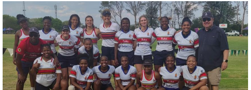
Tuks Womens 7s team who played against the Rustenburg Vixens at Hoërskool Wagpos.