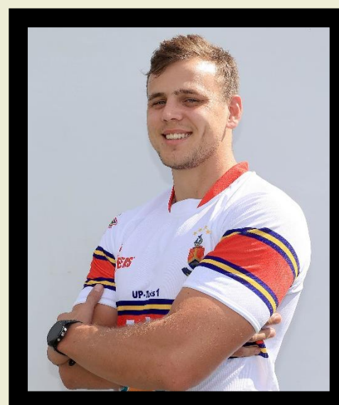
Field of Study: BCom investment management, PGDip Entrep. VC Debut: 2018 vs Shimlas