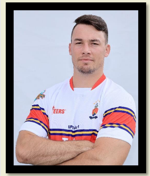
Field of Study: Education (Masters) VC Debut: 2020 vs UJ