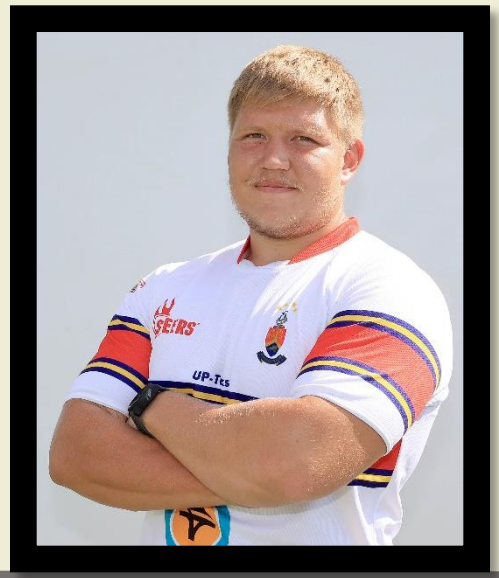
Field of Study: Education VC Debut: 2019