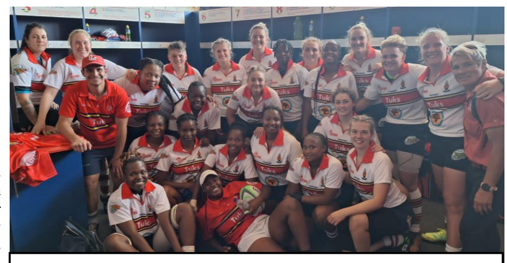
FNB UP-Tuks Womens team after their first league victory over Harlequins women.