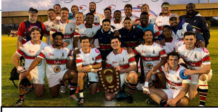
FNB UP-Tuks 1 with the Bergmann-Claassen Shield.

The last game for May was against Centurion where the teams played for the Bergmann-Claassen shield. Tuks won that game and also received the shield which will now be with the club until the