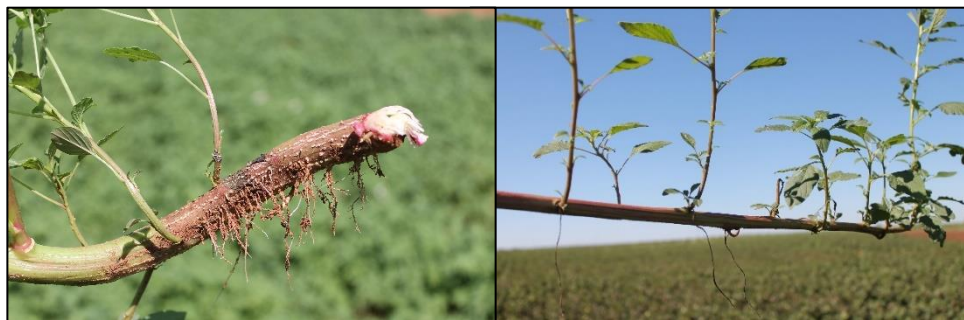
Photo 5. Vegetative growth observed on weeded plants left in the field.