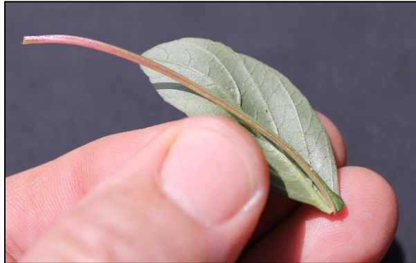
Photo 3. Palmer amaranth's leaf petiole is as long as, or longer (up to 3 cm longer) than its leaf blade