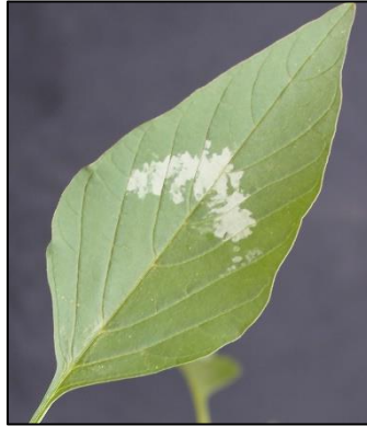
Photo 1. Lanceolate shaped leaves, and V-shaped chevron that is visible on some but not all plants