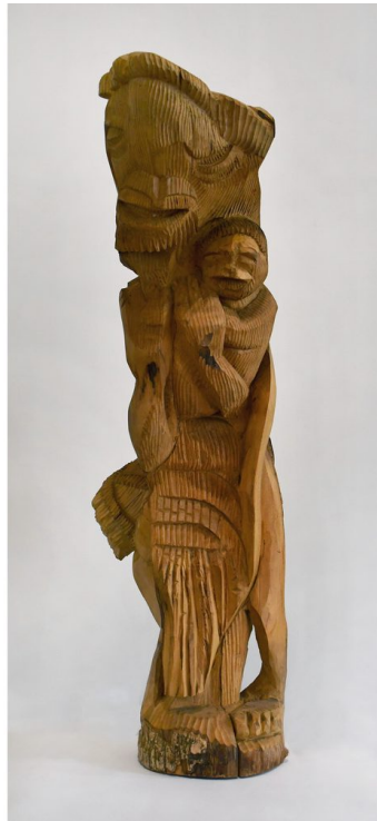
Marikana, 2016 Mashifane Makunyane Wood 1020mm x 490mm Art Collection