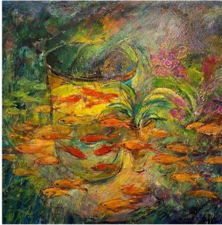
Gwen & Matisse, 2020 Phillip Badenhorst Oil on Canvas 900mm x 900mm