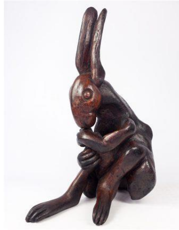
Pensive Rabbit, 2020 Michael Teffo Eucalyptus wood 1080mm x 700mm x 500mm