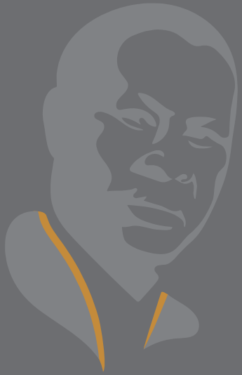
The life of Chief Albert Luthuli through the arts