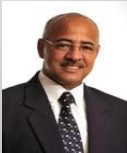
Acting Head of Department