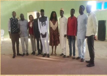
Training with youths in community