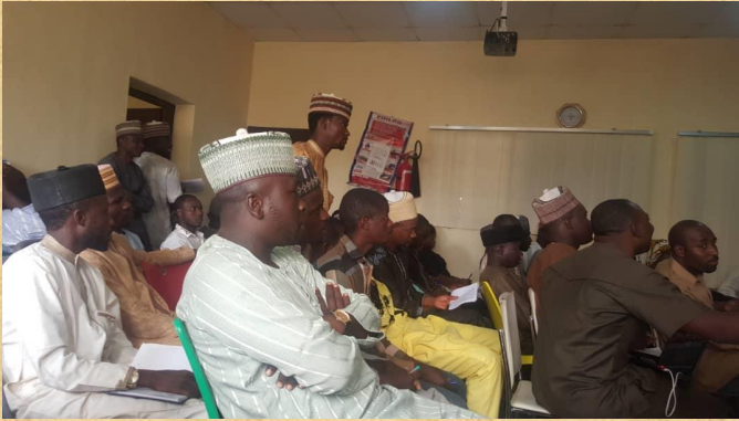
Library training on use of eresources