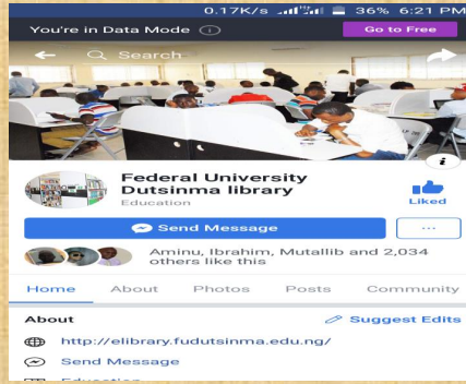
Facebook page of FUDMA library