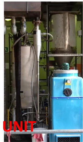
Pyrolyser(front), feed bin(behind), blower(back right) Separation equipment (left back)