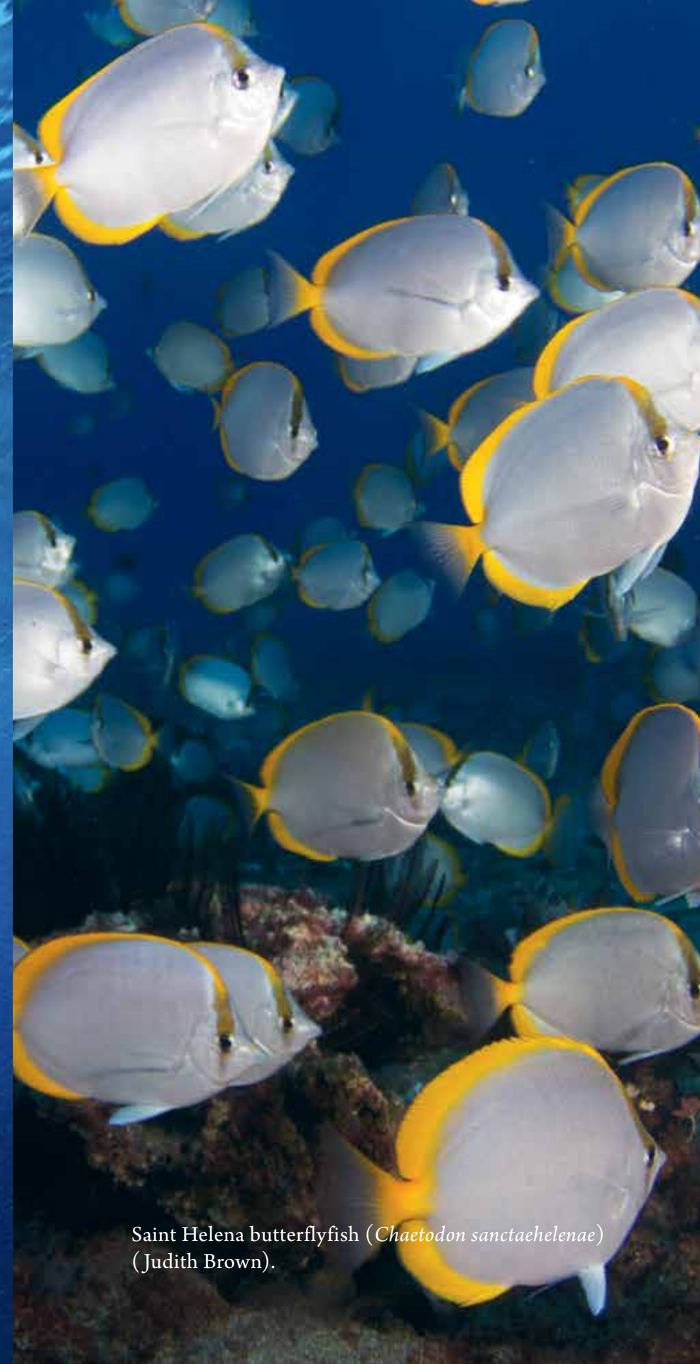
Saint Helena butterflyfish ( Chaetodon sanctaehelena).