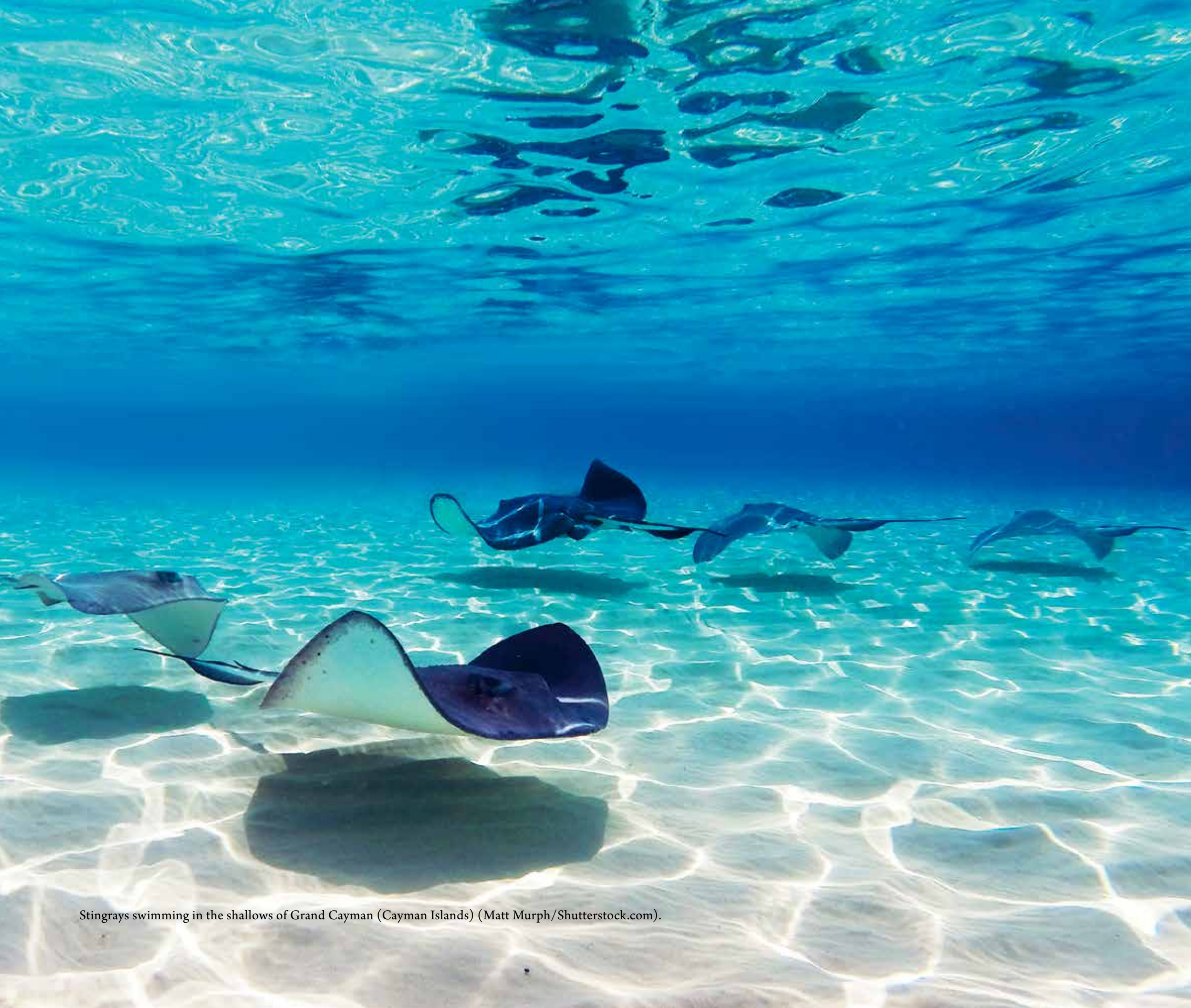
Stingrays swimming in the shallows of Grand Cayman (Cayman Islands).