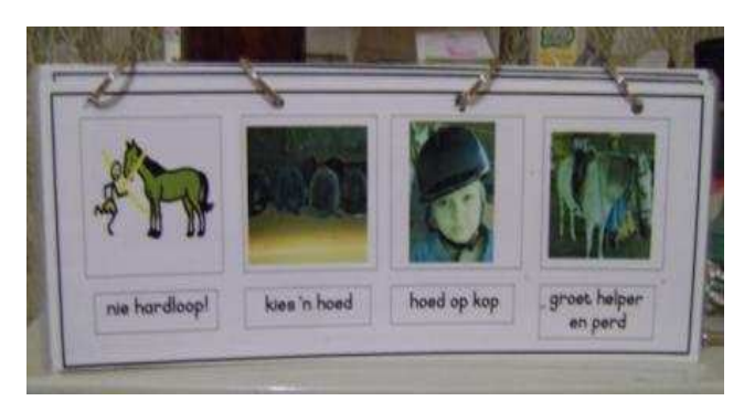
A visual schedule used by some of the children on horseback