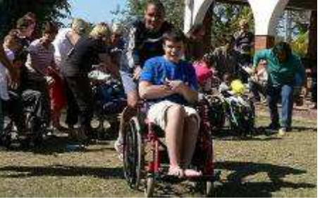
Up for a race? On your marks, get set, go!

Great fun was had by all with the children thrilled to show off their friends and skills while the even dads and granddads forgoing an SA rugby match in favour of the wheelchair and bean bag races!