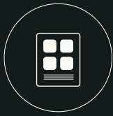
LAYOUT & EDITORIAL DESIGNER