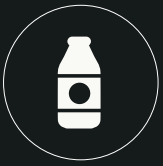
PRODUCT & PACKAGING DESIGNER