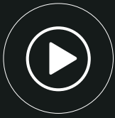
ANIMATOR/MOTION GRAPHIC ARTIST