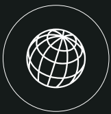
WEB & MOBILE DESIGNER