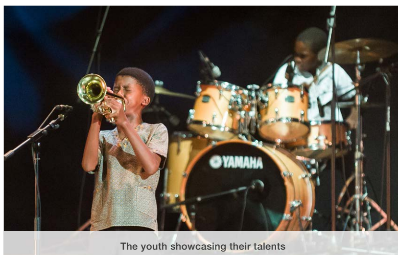
The youth showcasing their talents