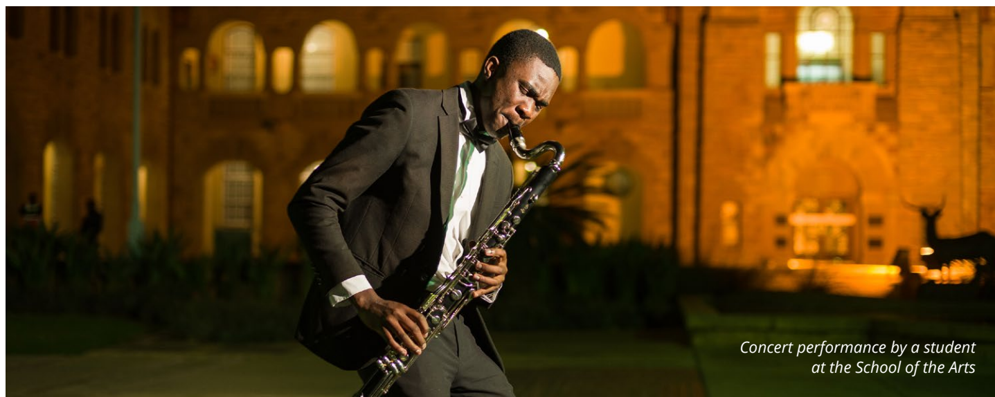
Concert performance by a student at the School of the Arts

Have some time to spare in between lectures on main campus? Here are five things to do on the University of Pretoria's Hatfield Campus. Click here to read more.