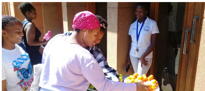
Free fruit provided by Faculty of Theology and Religion