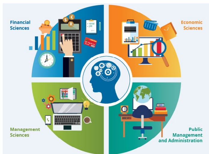
Areas of specialisation

Still confused about what to choose? Our programme infographics will guide you based on your interests and academic performance. Click here to access the infographics.