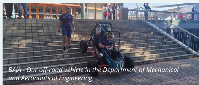
BAJA - Our off-road vehicle in the Department of Mechanical and Aeronautical Engineering

Innovation is our business. Not only innovation that leads to real-world change on the outside, for the good of humanity and the planet, but also innovation on the inside. The EBIT generation is a generation that leads change with an awakened mind and a generation that cares for their fellow human beings. Amidst all the changes, we are still a human-centered faculty. If this sounds like you, then don't hesitate, visit www.up.ac.za/ebit and become a part of the EBIT generation.