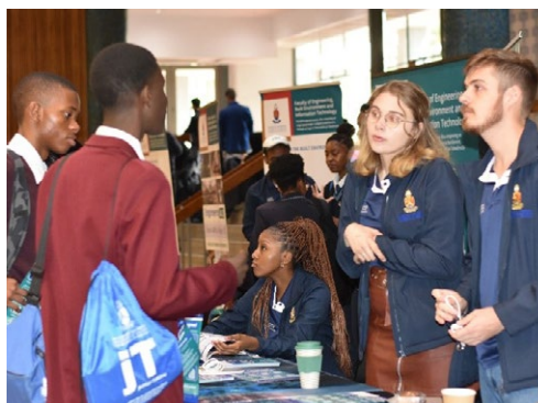
Learners ask questions at the faculty exhibitions

Excited Grade 11 learners arrived at the University of Pretoria early on Thursday, 20 April and on Friday 21 April 2023 to attend the Grade 11 Academic Achievers function. This event was hosted by the JuniorTukkie team in the Department of Enrolment and Student Administration (DESA) over two days due to limited space. The same programme was presented on both days. This prestigious event was attended by approximately 724 guests that included Grade 11 academic achievers, Life Orientation teachers and JuniorTukkie members from schools all over the country. Click here to read more.