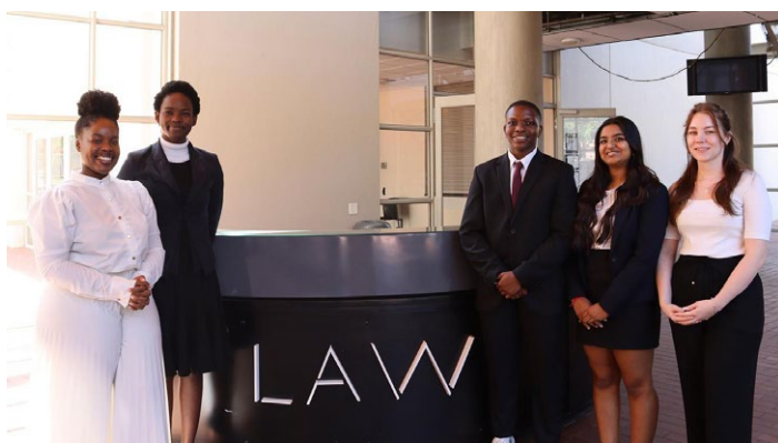
UP Law Moot team