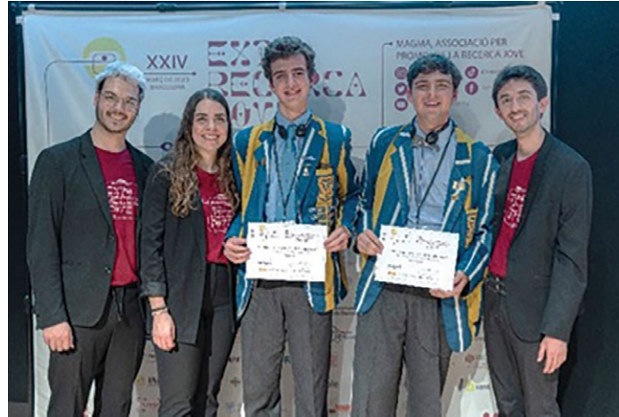
Winners of the international category in Spain