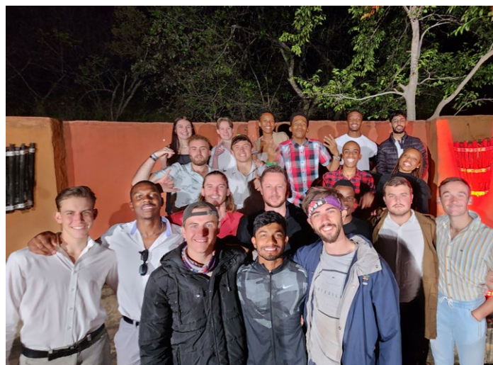
The cast of TuksRes Survivor 2023