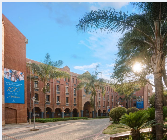
The Faculty of EMS building