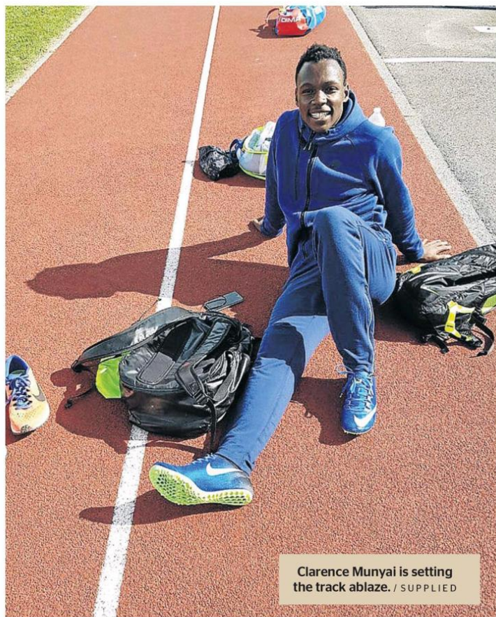
Clarence Munyai is setting the track ablaze.