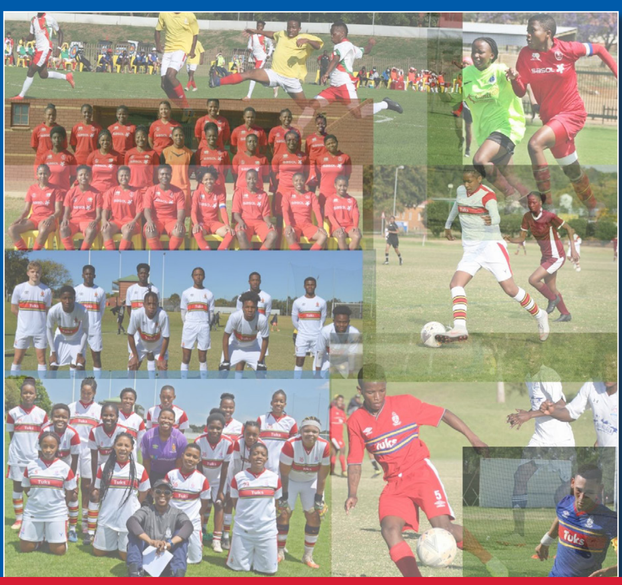
FND OF THE YEAR NEWSLETTER