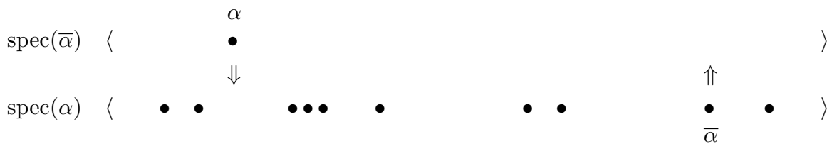
Figure B. By hypothesis, either \alpha \in \text{spec}(\bar{\alpha}) , or \bar{\alpha} \in \text{spec}(\alpha) . Here \alpha is not in \text{spec}(\bar{\alpha}) , so \bar{\alpha} must be in \text{spec}(\alpha) .